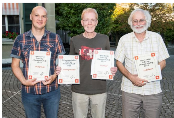
Winner photo 2016

Registration: please specify if you need a chess board and if you join for the dinner latest by 2 September 2017 to: SLM@kunstschach.ch